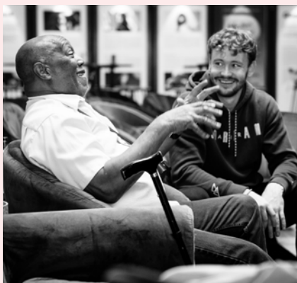
Montreux Jazz Festival Residency 2023